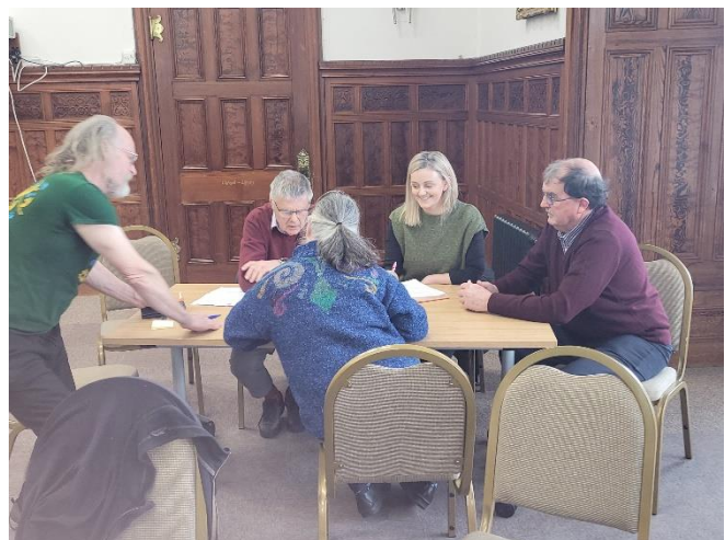
Above: Photos from the 'Arloesi Gwynedd Wledig' workshops held over winter 2022-23.